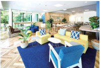
LINK-J communication lounge

At KING SKYFRONT, KING SKYFRONT Network Council centered on local institutions conducts joint projects to make the local area more attractive. These activities have created a "face-to-face" relationship with each other and lead to the creation of new businesses through collaboration.